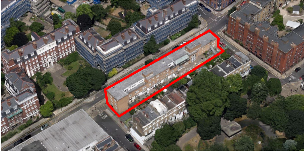
Image 2. Birds eye