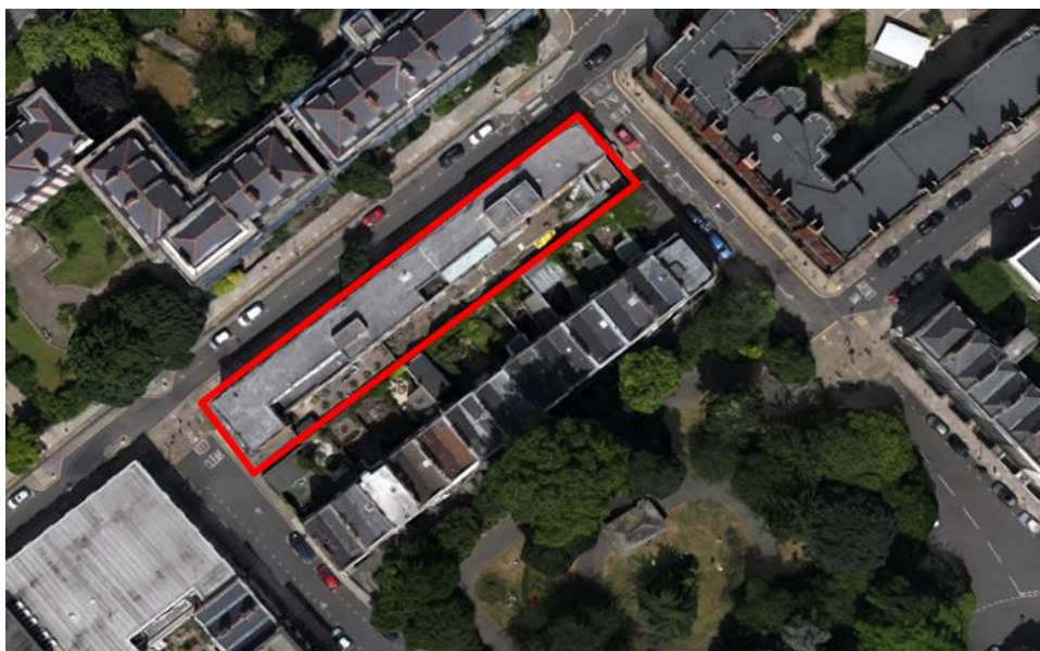
Image 1. Aerial View