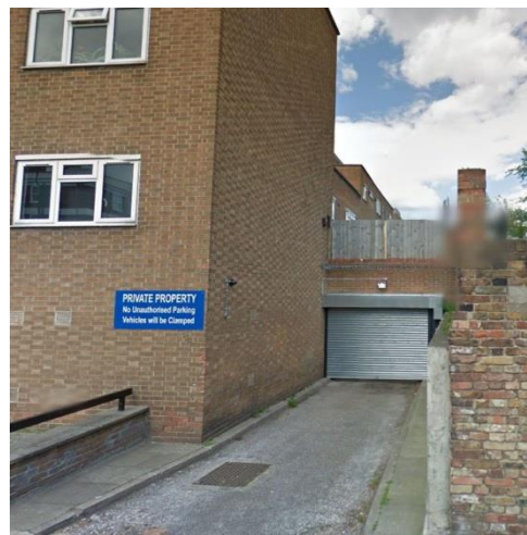
CAR PARK ENTRANCE: 2017